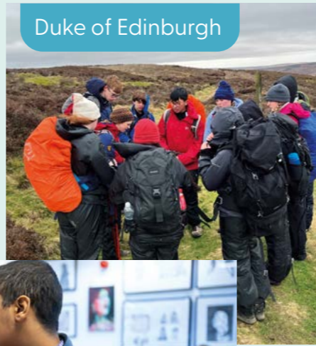
Duke of Edinburgh