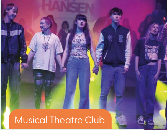
Musical Theatre Club

Want to see the activities in more detail?