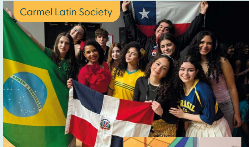
Carmel Latin Society