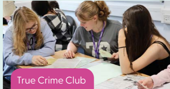
True Crime Club