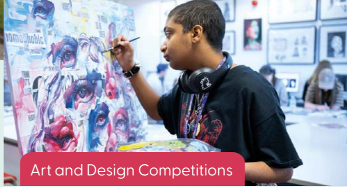
Art and Design Competitions