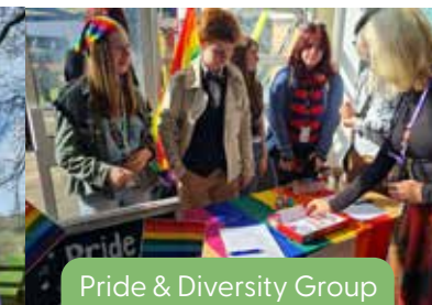
Pride & Diversity Group