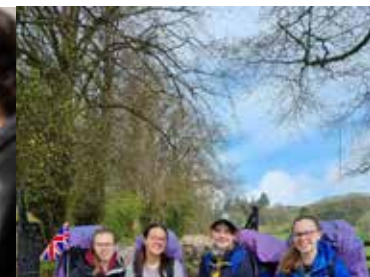
Duke of Edinburgh