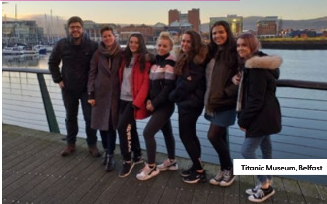
Titanic Museum, Belfast

Enrichment Programme offering debate, links with the Drama department and the feminist poetry group.