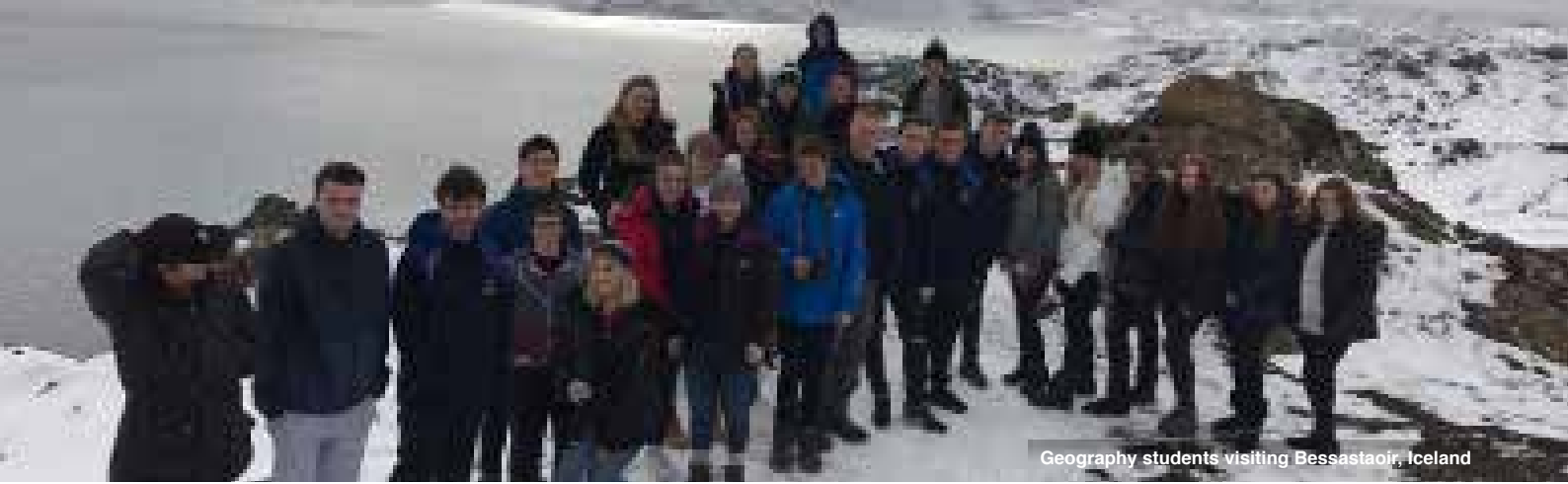
Geography students visiting Bessastaor, Iceland