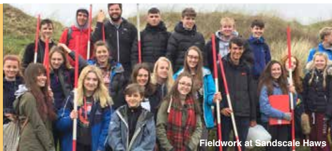
Fieldwork at Sandscale Haws